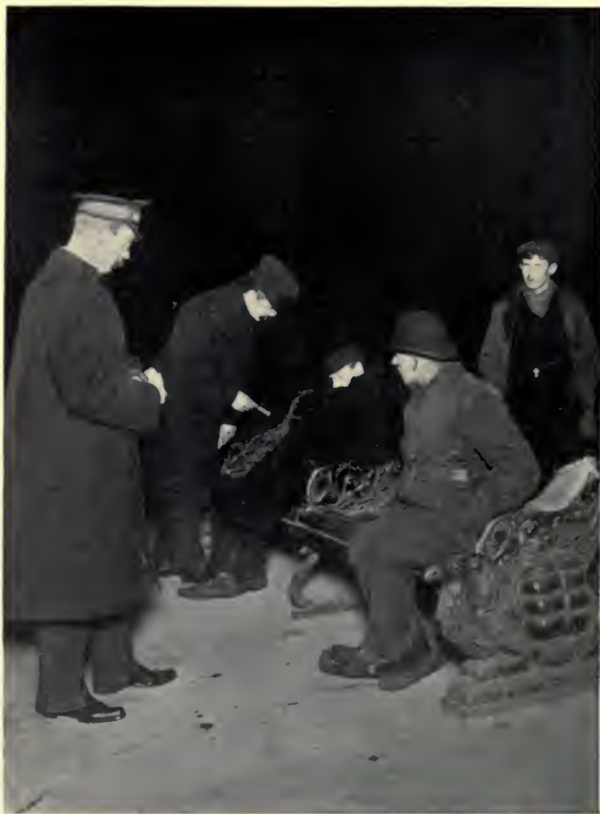
SEEKING THE HOMELESS AT MIDNIGHT